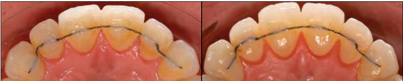
Figure 7. Left . Excess, rough composite resin was a constant irritant to the patient and an interference to proper lower incisor contact. Right . Recontoured and polished composite with 1 mm of coverage over the wire to resist abrasion and loss of wire retention.

creates a polished, continuous surface from canine-to-canine without exposed rough spiral wire or gaps between the wire and the lingual embrasures (Fig. 6). These areas can trap food, and the rough wire may not be tolerable to some patients. Dentists can also improve existing wire retainers by recontouring excess composite resin (Fig. 7).