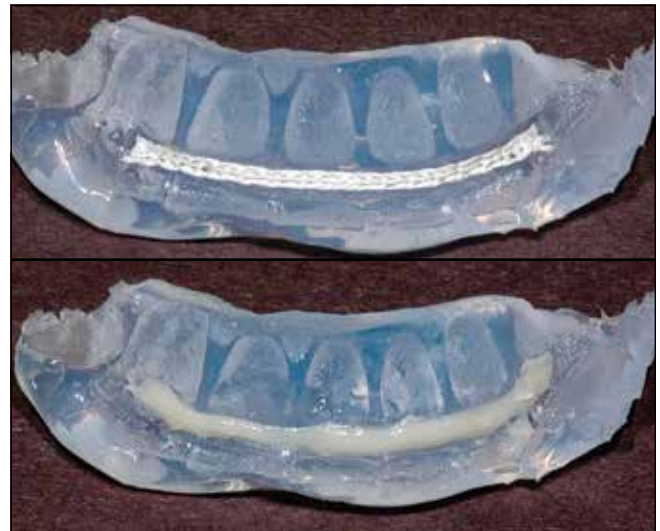
Fig. 4 Top . Ribbon in matrix recess formed by the wax shape. Bottom . Ribbon pressed into the filled composite resin. The matrix will adapt the composite resin and place Ribbon closely against the teeth.

resin to the teeth, thin with air, and light polymerize for 10 seconds. Wet the Ribbon-ULTRA with a thin layer of unfilled resin. Apply a thin band of filled composite resin to the teeth at the level of the interproximal contacts and press in the Ribbon-ULTRA, tucking into the interproximals for close adaptation. Light polymerize for 60 seconds. Cover the surface with flowable composite and polymerize for 60 seconds. Contour and polish with carbide finishing burs and rubber points.