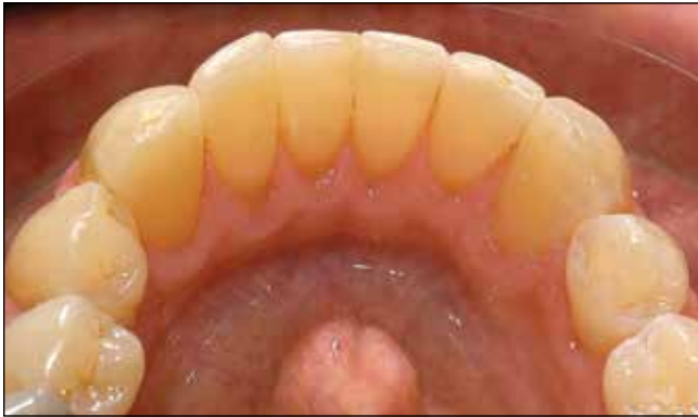
Fig. 1. Lingual view of the postorthodontic alignment.