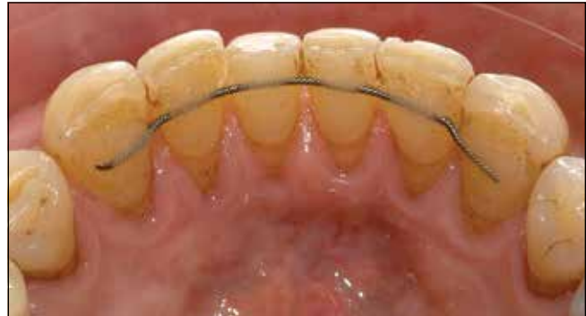
Fig. 6. Wire-composite resin retainer. The rough spiral wire and gaps between the wire and teeth can trap food and irritate the patient's tongue.