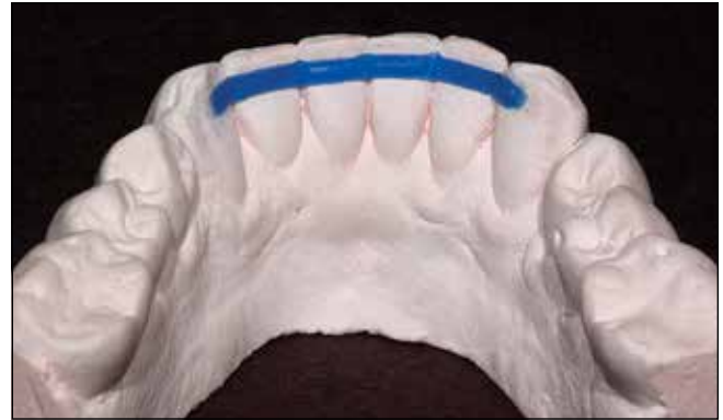
Fig. 2. Fast-set stone cast with 12-gauge half-round wax at the level of the interproximal contacts to maintain gingival embrasure space.