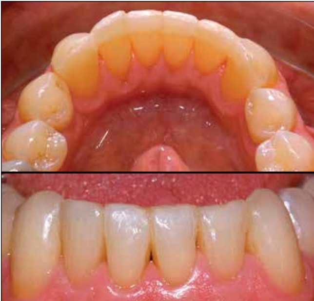
Fig. 5 Top . Lingual view of finished composite resin/Ribbon bonded retainer. The surface is smooth and continuous with natural contour for patient comfort. Bottom . Facial view of bonded retainer. Note the open gingival embrasure space to facilitate oral hygiene with floss threaders.