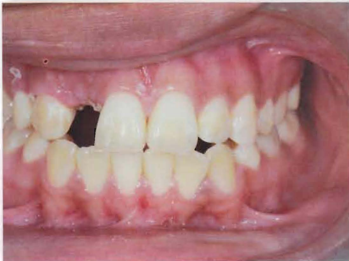
Figure 2—Retracted view of the patient reveals the contra-lateral view of the maxillary left lateral incisor.