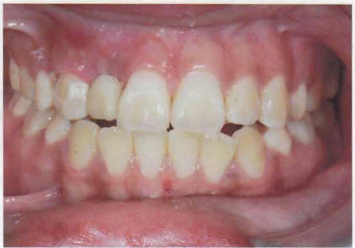
Figure 11 —Labial view of the composite provisional demonstrates proper positioning and similar appearance to the contra-lateral tooth. The pontic provides support for the soft tissue in the area to initiate site development.