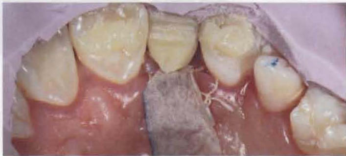
Figure 10 —A putty stent (Coltene Whaldent) fabricated from the wax-up was used to position the composite pontic in the correct position. We placed composite (Amelogen Plus, Ultradent) on the lingual of the abutments and on the pontic. While still soft, the flowable composite-impregnated Ribbond was pressed into the composite, excess removed, and then light cured for 20 seconds on the lingual of each tooth. Then we placed a layer of flowable composite resin and created a smooth surface with a brush. Occlusion was verified, and any interference was removed as needed. The lingual surface required minimal finishing and polishing.