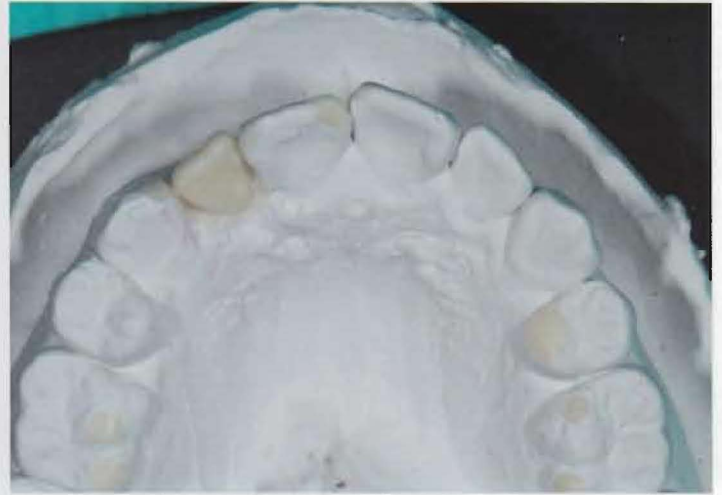
Figure 5 —Occlusal view of wax-up of tooth No. 7 shows proper arch position.