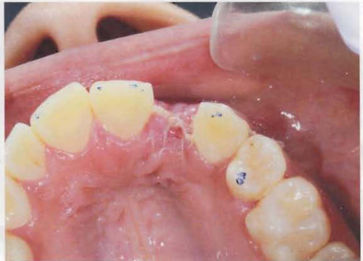
Figure 3—Occlusal view of the extraction site illustrates the ridge's buccal/lingual dimensions. Articulating paper indicates centric stops and demonstrates adequate clearance for the fiber and composite on the lingual.