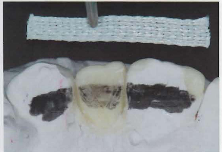
Figure 7 —The provisional bridge. We then cut Ribbond material with special scissors to cover area from the distal of the adjacent central incisor to the distal of the canine. This was used to connect the pontic to the abutments.