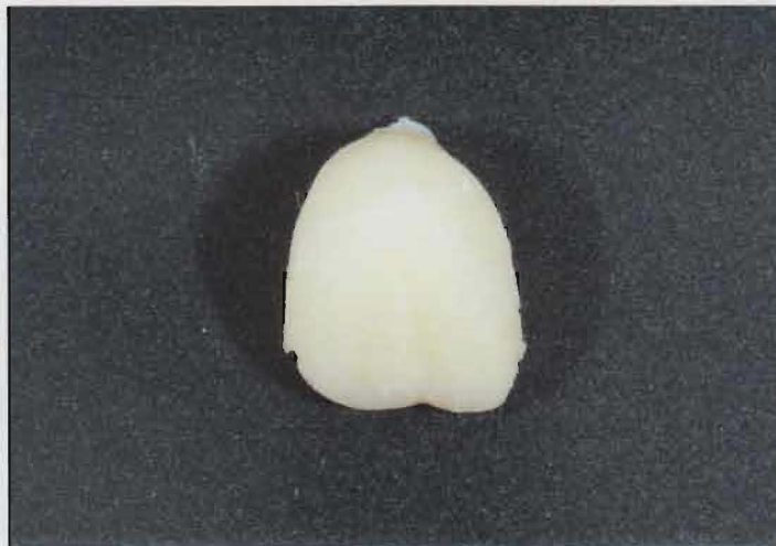
Figure 6 —We used clear impression material (Memosil, Heraeus Kulzer) to duplicate tooth No. 7 pontic with composite resin. Composite resin pontic was duplicated from the wax-up (shown).