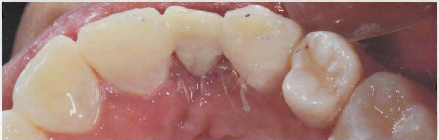
Figure 12 —Occlusal view of the pontic shows the incisal edge lined up with adjacent teeth.