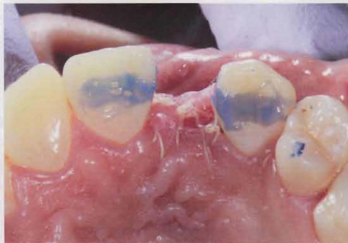
Figure 8 —The adjacent teeth were etched with 35% phosphoric acid for 15 seconds and then Peak LC Bond Resin Adhesive (Ultradent) was placed, air dried, and light-cured for 20 seconds.