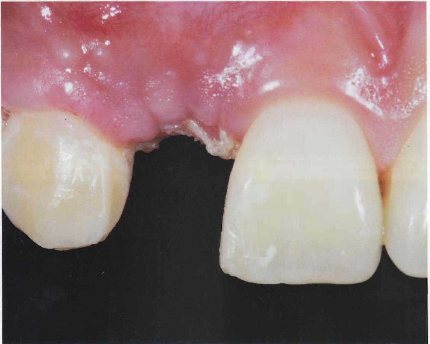
Figure 1—The patient presented with the maxillary right lateral incisor missing and a bone graft.